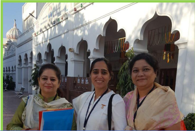
At the conference venue

At CIS, value education classes are helping to shape young lives and empower students to be caring and compassionate human beings. It is our endeavour to make students aware of their inner strengths and develop a positive attitude towards themselves and others. This conference has given us the inspiration to continue to bring values into practice and be role models for our students. Their emotional well being is equally important to us. Students will be recognized and awarded for displaying good values and thereby setting an example for others.